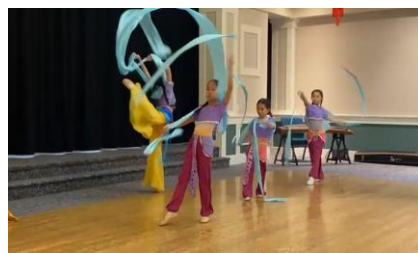
Chinese New Year Celebration Shannon Oaks Retirement Home