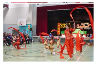
Chinese New Year Celebration SFX Parish