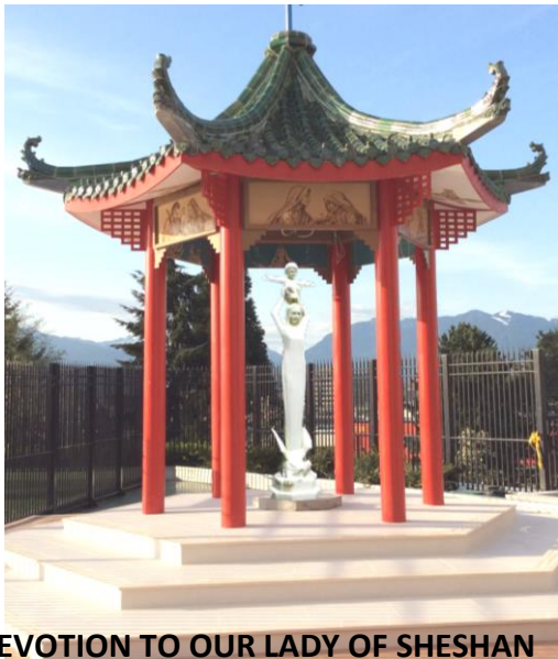
DEVOTION TO OUR LADY OF SHESHAN