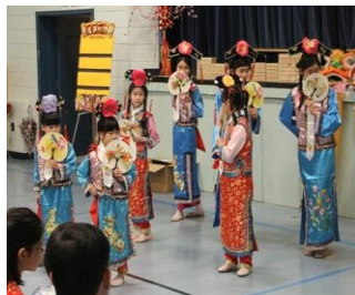
Special Event Celebration Corpus Christi Parish Celebration