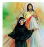
—耶穌要修女將祂「顯現的像」畫出來 ST. FAUSTINA