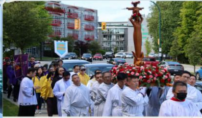
St. Francis Xavier Parish 438 Great Northern Way Vancouver, B.C.