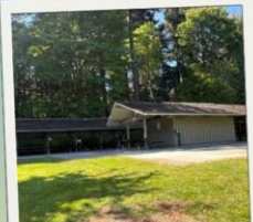
Picnic Area - Between Stanley Park Railway and Lumberman's Arch